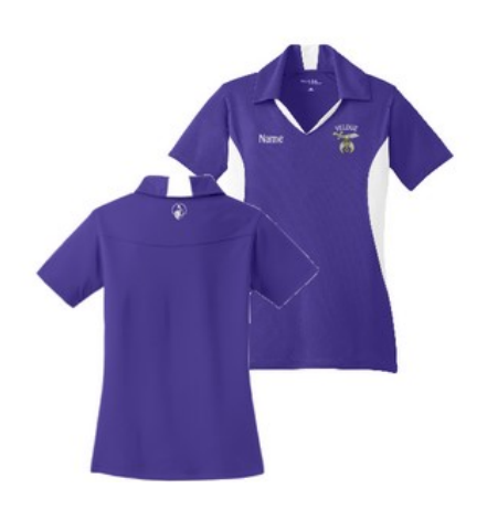
Women's 2023 Shirt

The 2023 shirts are now available at the online store with Geffdog. You will be able to order your shirts directly from them and you pay them. To order your shirt just go to: